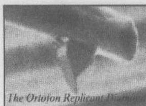
The Ortofon Replicant Diamond

Many have asked the question: Why is the sound of a moving coil cartridge so superior to that of a traditional magnetic design? The answer in one word, is linearity. The patented Ortofon low-output, low-impedance design is inherently linear over the entire audible range. This coupled with unequalled tracking ability and unique diamond profiles combines to deliver a sound previously deemed unattainable. Exact polishing of the diamond profile is vitally important in order that every minute musical detail can be extracted without damage to records (the profile of the replicant diamonds are as near to the original cutting shape as possible without re-cutting your precious vinyl). Naturally the reject rate in this process is extremely high, but only the very best diamonds are fitted to the Ortofon '000 series. Every cartridge is tested at least 15 times during manufacture. The result is a musical instrument to be proud of.